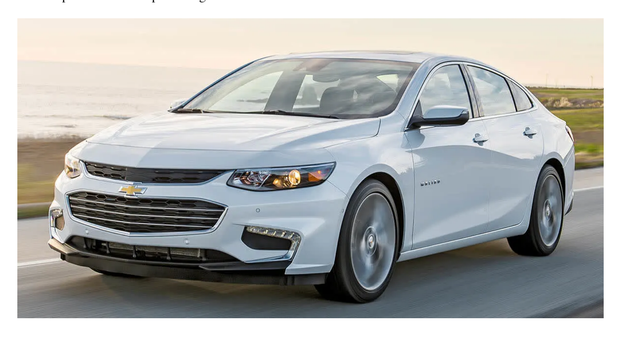
Chevrolet and Buick Sedans and GM SUVs Recalled for Fire Risk, Power Loss...