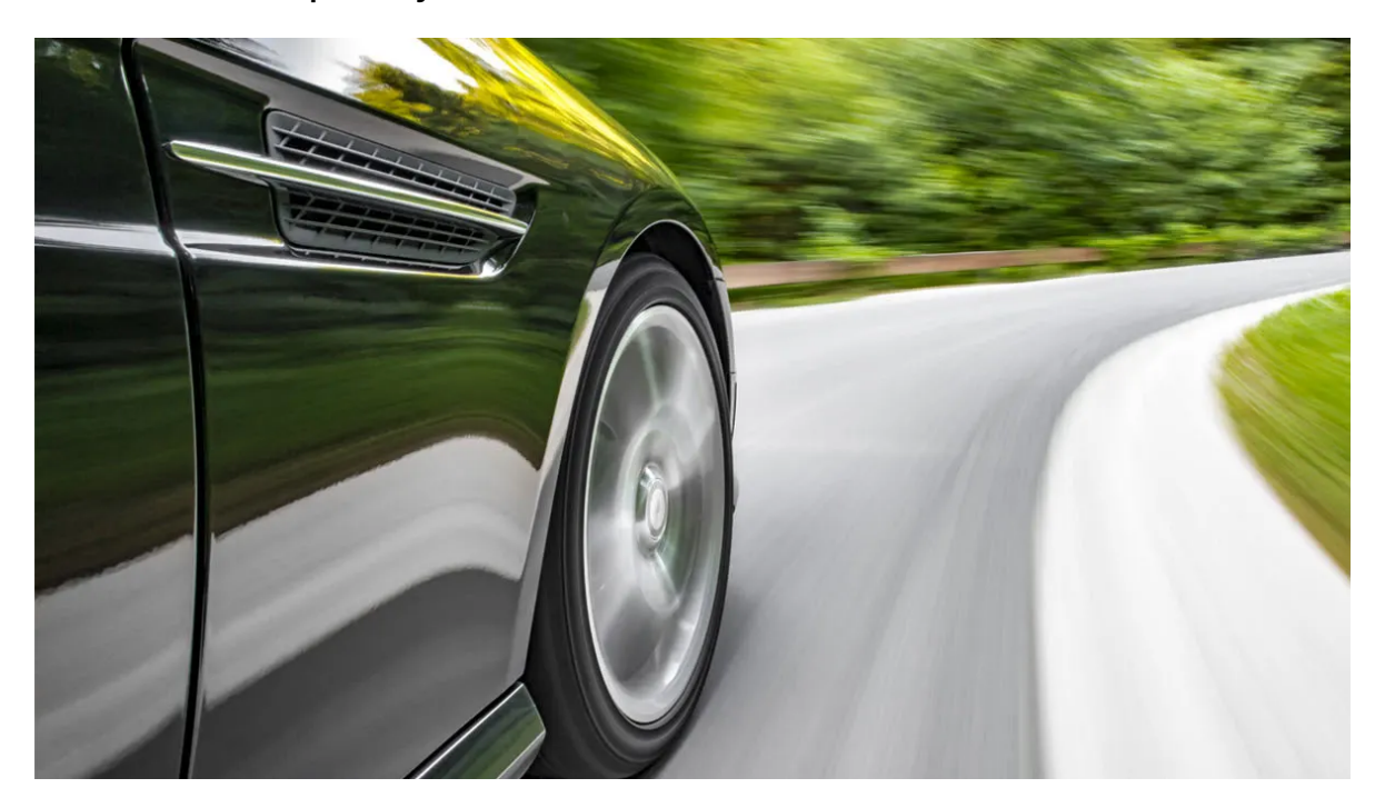
How to Choose the Right Tires for Your Car, SUV, or Truck