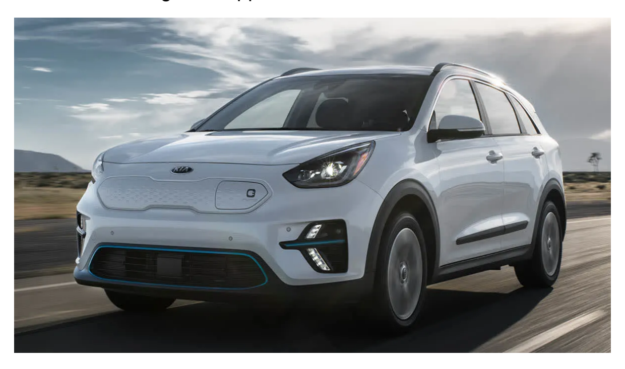
Electric Cars 101: The Answers to All Your EV Questions